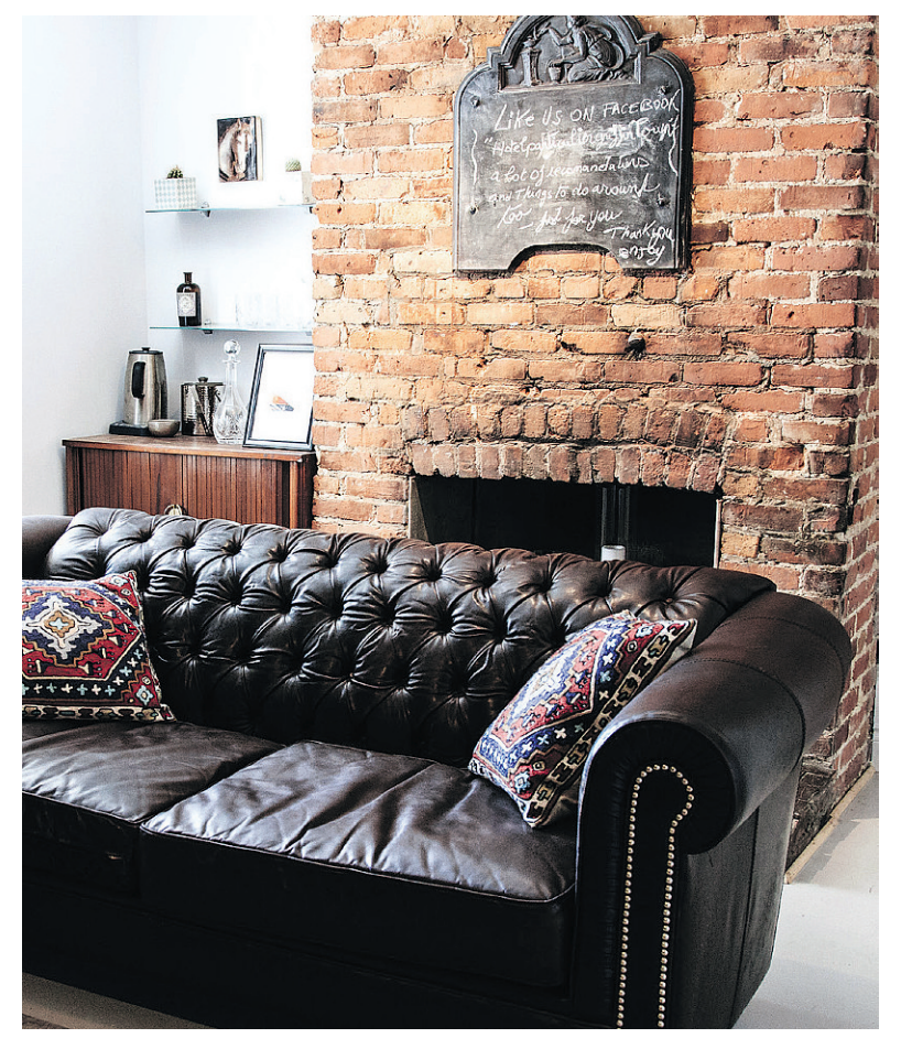
Vintage touches reflect "the soul of the place." The B&B also offers a cultural fix, doubling as an art gallery of constantly changing works.

La Bête à Pain, supplies breakfast: juice, coffee and treats