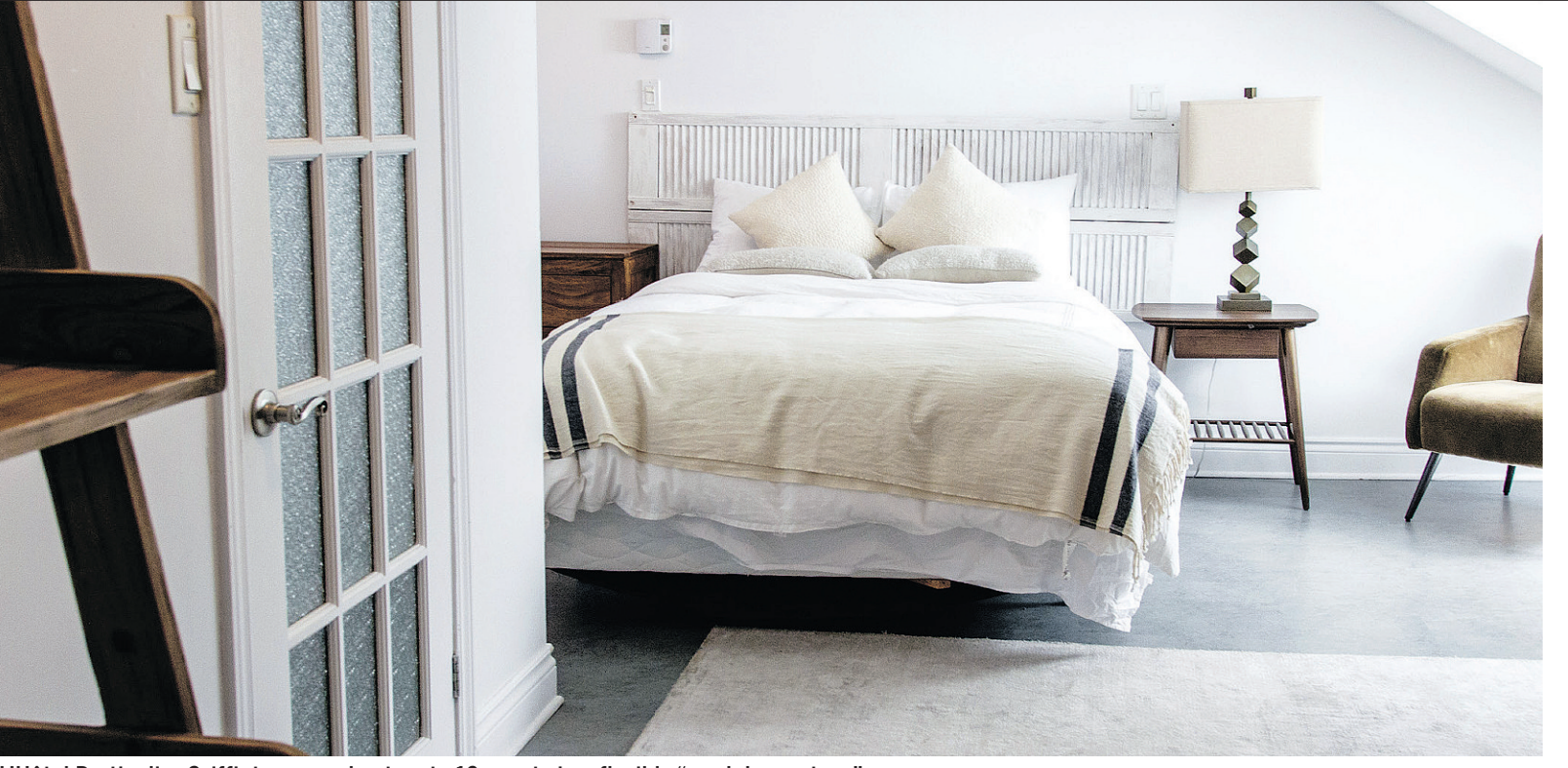
L'Hôtel Particulier Griffintown can host up to 16 guests in a flexible "modular system."